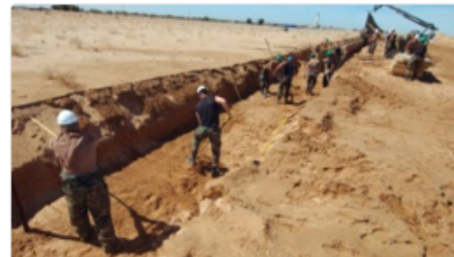
Working in manual labor, heat stress

NIOSH has established laboratories, divisions and offices across the nation in Anchorage, Alaska; Atlanta, Georgia; Denver, Colorado; Cincinnati, Ohio; Pittsburgh, Pennsylvania; Spokane, Washington; Morgantown, West Virginia; and is headquartered in Washington, DC. In addition, NIOSH has eight “ virtual centers ” through which researchers at its geographically dispersed locations work together to achieve NIOSH’s vision of safer, healthier workers.