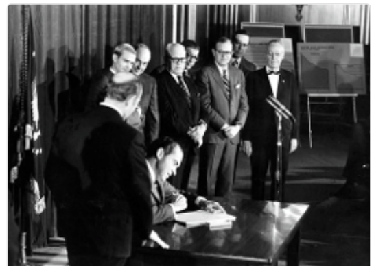
Presidential signing of OSH Act of 1970

Throughout the past five decades, NIOSH has produced research and resources for specific regional occupational hazards, like those in the fishing, oil and gas, firefighting, and mining industries. The Institute has simultaneously addressed issues prevalent across nationwide industries, as in construction, healthcare, manufacturing and the service industry, to name a few. NIOSH expanded its work to include emerging safety and health concerns in areas like nanotechnology, robotics, stress, fatigue and ergonomics, and workplace design and well-being. The Institute has played a prominent role in emergency response, including the most recent global health crisis, and continues to partner with like-minded organizations and agencies to promote mutually reinforcing work.