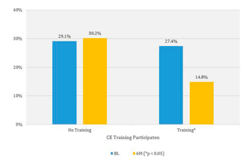
Figure 1. Weighted percentage of primary care providers agreeing patients age is a barrier to discussing sexual risk by survey time and consuming medical education training in selected southern states – Knowledge, Barriers, Attitudes and Practices of HIV Providers in Southeast Study, 2017–2018.