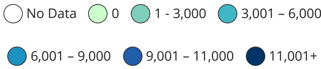
U.S. COVID-19 Vaccine Administration by Vaccine Type

Number of People Receiving 1 or More Doses per 100,000