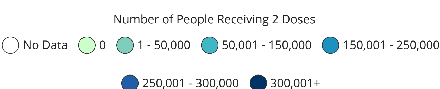
U.S. COVID-19 Vaccine Administration by Vaccine Type