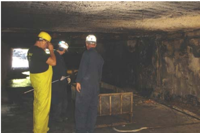
Figure 7. Test 1 coal fire configuration.

In the first test, a 12-inch-deep layer of minus 2-inch Pittsburgh seam coal was spread evenly in a steel mesh box, 3-ft-wide by 6-ft-long, shown in figure 7.