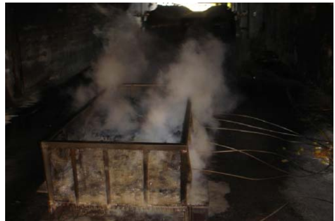
Figure 8. Coalbed after Barricade II/water mixture application.

The fire was allowed to burn for 23 hours. During that time, the fire propagated through the coalbed, so that the entire coalbed was on fire at time of extinguishment. Barricade II was educted into the fire hose at a 3.0 pct concentration at the hose nozzle. The gel concentrate was applied through the same eduction nozzle used in the in-mine application experiments. The person extinguishing the fire carried a 4 gallon supply of the Barricade II gel concentrate in a back-pack system. After 23 seconds of application, the coal fire was suppressed and cooled to a point that re-ignition did not occur. Water vapor was readily visible, but coal smoke was significantly suppressed. The team member extinguishing the fire noted that yellow fumes were emitted during the suppression process, but there was no re-ignition of the fire. It was also noted by the team that, except for nozzle overspray, there was virtually no gel or water directly below the fire box. This indicates that the mixture was adhering to the coal. It was observed that Barricade II application also had an “encapsulating effect” on the coalbed, shown in figure 8.