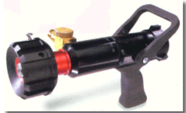
Figure 1. Gel Pro-30 nozzle.

The nozzle is modified to educt and mix Aqueous Firefighting Gel, Class A and B foams or wetting agents. The variable ratio eductor allows three different mix settings (1 pct, 3 pct and 6 pct, depending upon the viscosity). The eductor is calibrated for 30 gal/min at 100 psi and can operate in the pressure range of 70 to 150 psi. Eduction nozzles such as the Gel-Pro 30 work on the venturi principle with an attached vacuum chamber. There are two orifices that the gel concentrate moves through. There is an orifice in the body of the nozzle at the venturi and one in the vacuum chamber that also includes a spring valve to prevent potential back pressure from forcing water back into the gel concentrate container. These two orifices must be sized appropriately to allow for the maximum flow rate and pressure.