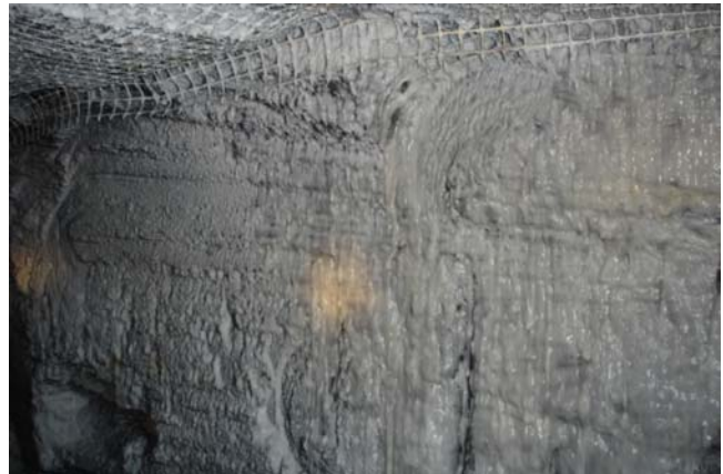
Figure 2. Roof and rib after gel application.

gallon bucket of Barricade II concentrate. The advance application took 5.2 min. Total spray time as determined from the video was 4.3 min. Bucket change-over took 52 s. The team examined the roof, ribs and face for application consistency and decided that no additional application was necessary. The amount of Barricade II concentrate used for the application was 5.5 gallons. Total water used through the 30 gpm nozzle for the 4.33 minute application was 129 gallons, yielding an average Barricade II to water percentage of approximately 4 pct. The total square feet of application to the roof, ribs and face was 1580 ft 2 . Figure 2 shows the roof and rib after the application test.