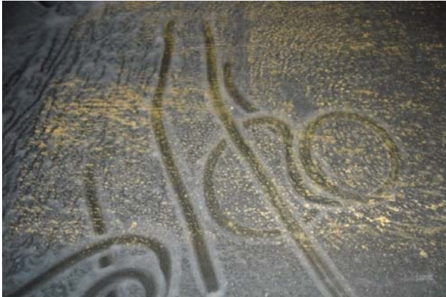
Figure 6. Barricade II coating on top conveyor belt after sprinkler application test