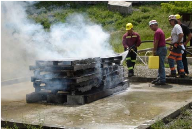
Figure 19. CONSOL personnel extinguishing wood pallet fire.

When the untreated pallets were fully involved in fire, the CONSOL mine rescue team members quickly extinguished the fire using a hose with a 3 pct concentration of Barricade II, shown in figure 19. From start of extinguishment to the fire being out took 28 seconds.