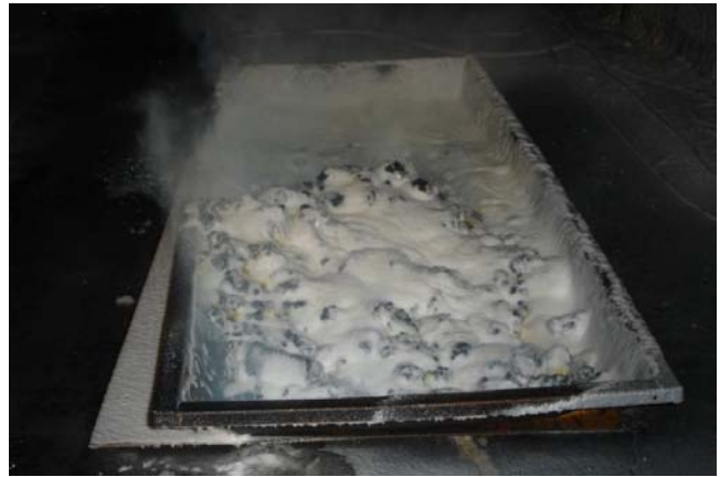
Figure 12. Coal bed just after extinguishment.