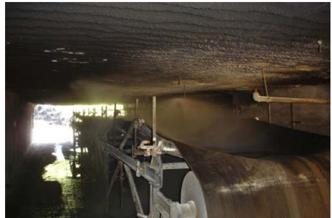
Figure 5. Second water/Barricade II sprinkler flow test.

The results of the sprinkler system application of Barricade II gel on the conveyor belting, shown in figure 6 after the second flow test on the top belt surface, indicates that the introduction of Barricade II into a main water line and sprinkler system in a concentration that would both flow throughout the system and be in a concentration to be effective in firefighting is feasible. The gel coating on the belt surface showed uniform thickness and consistency, equivalent to a coating applied through the end of a fire hose. Based on the sprinkler system application results and previous unreported tests conducted in above-ground experiments on the application and extinguishment of rubber tire fires, it is evident that the introduction of Barricade II into the sprinkler system to extinguish a belt fire should yield the same effective results as was found by using gel through the end of a fire hose.