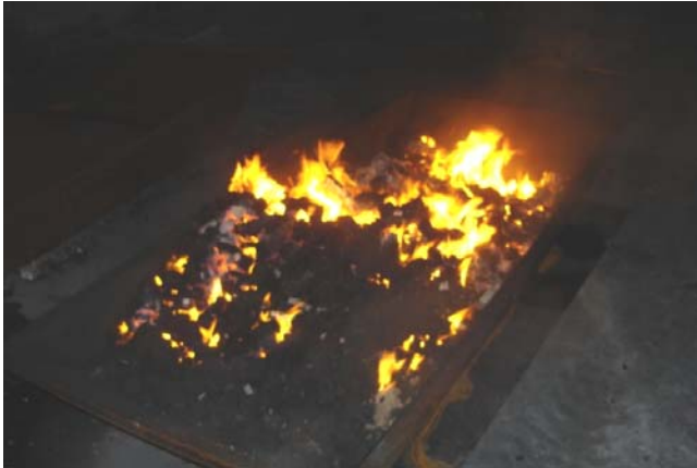
Figure 9. Coal fire just prior to extinguishment by mine rescue team.

After a brief training exercise on the proper use of Barricade II application through end-of-hose education, the CONSOL team extinguished the fire. The CONSOL team used a standard 1½-in fire hose with the Gel-Pro 30 education nozzle. The water pressure was 125 psi and the Barricade II/water concentration used was 4 pct. The fire was extinguished in 70 seconds. A hand-held temperature probe was used immediately after the test and showed temperatures in the coalbed ranging from 75 - 100 °C. Figures 10 and 11 show the team approaching the coal fire and applying the gel/water mixture. Figure 12 shows the coal bed immediately after extinguishment.