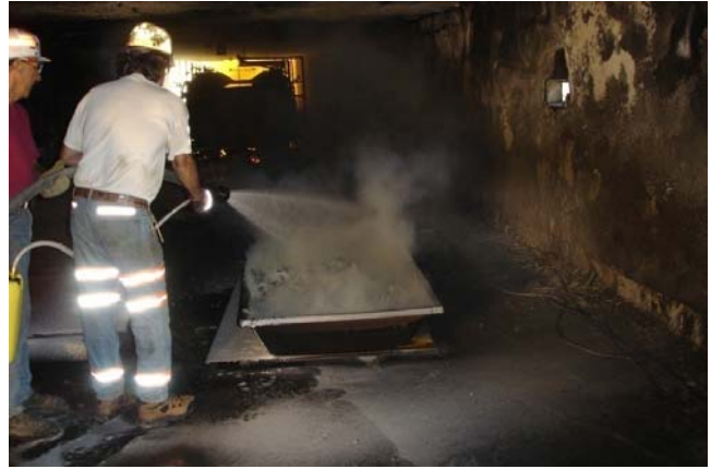
Figure 11. Mine rescue team extinguishing the coal fire.