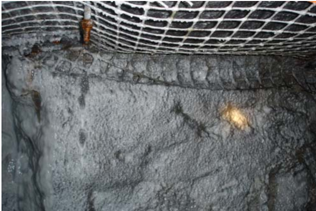
Figure 3. Roof and rib 48 hours after gel application.