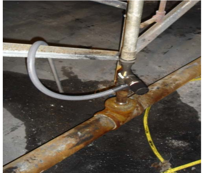
Figure 4. Eductor in 1-1/2 in water line.