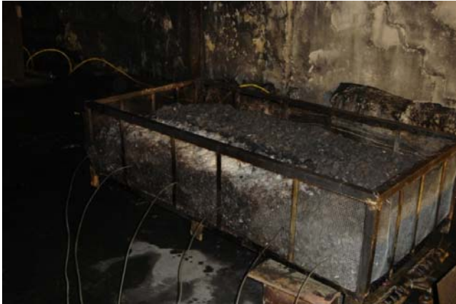
Figure 13. Coalbed prior to ignition.

Figure 14 shows a top view of the location of the thermocouples. The area shaded in blue is the coal treated with the 3 pct mixture of Barricade II.