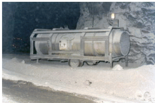
Figure 1. Jet fan.

The low pressure loss present in these large opening mines is actually an advantage compared to other type mines and should be treated as such. The ventilation principles, concepts and techniques used to ventilate these mines are different from the techniques used in mines with larger pressure losses. For example, axial vane fans have predominately been used where higher pressures are required. However, in large opening mines with low pressure requirements, propeller fans offer an alternative. The propeller fans can develop large air volumes under low pressure conditions. Propeller fans can be used as either main mine fans or as free standing auxiliary (jet) fans. Free-standing fans are commonly used to promote air movement as shown in Figure 1.