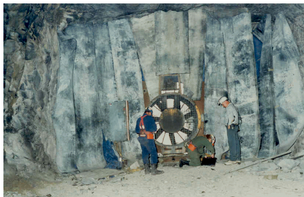
Figure 4. Used mine belt used pressure relief.

Used conveyor belting that is no longer useful for material transport can be used to make stoppings. The combination of used belting and brattice have been used effectively in stoppings for both sealing, production face shot relief, and flyrock or other physical damage protection. It has been successfully used as blast relief in a main mine fan bulkhead. Prior to utilizing the mine belt as shown in Figure 4, the mine had several stoppings blown over during production face shots. The mine belt weight and strength allow it to be strong enough to withstand the pressure wave from the face shot but flexible enough to give and act as a pressure relief. Belting hung in this manner should be hung in an overlapping concave pattern to promote interlocking of belting. This technique will minimize air leakage. Figure 5 shows used mine conveyor belt supplementing conventional mine brattice in a stopping. This combination minimizes leakage while providing protection, blast relief, and a more substantial stopping. Conveyor belts could also be used to shield conventional brattice stoppings from the fly rock damage shown in Figure 6.