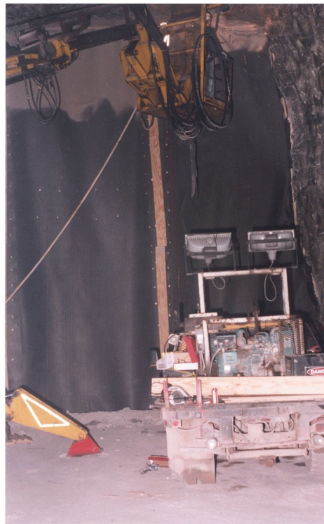
Figure 8. Fabric-grid material sprayed with cementitious material.

A prototype stopping being researched by NIOSH is a tension brattice stopping. The stopping is similar to the tension membrane construction methods used to create various fabric covered, large dome stadiums throughout the country. In this stopping, currently being installed and tested at NIOSH's Lake Lynn Laboratory, a brattice material is tensioned and attached to the various steel framework supports, thereby increasing the strength of the structure.