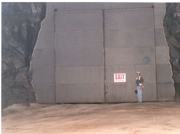
Figure 7. Stopping made for corrugated steel panels reinforced with a steel frame.