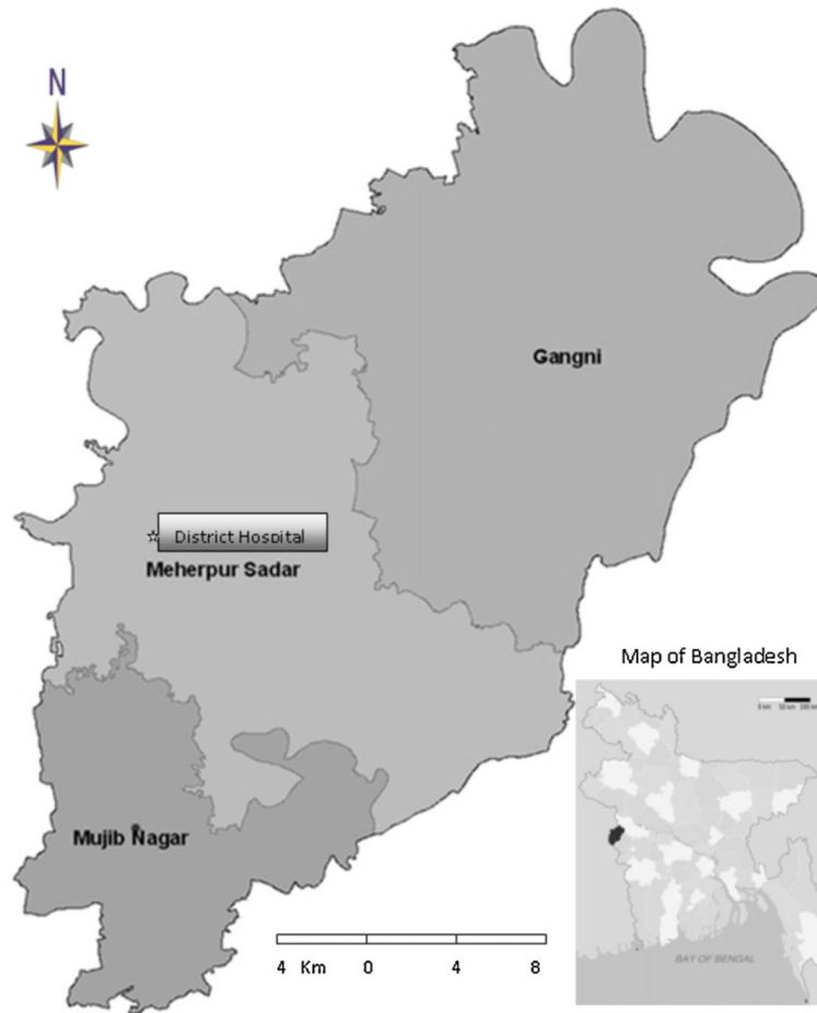
Figure 3. Map showing the approximate location of the general (district) hospital and the three RSV outbreak affected upazilas of Meherpur District.