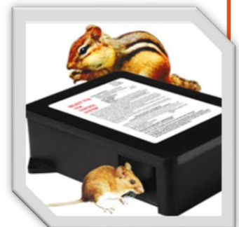
Antibiotic bait boxes became available to the public in 2011 and are registered by EPA in 22 states