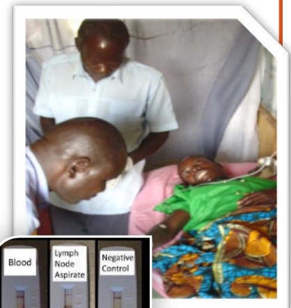
Clinicians caring for a plague patient

DVBD and academic partners are inventors on patents for nootkatone – a natural compound found in the essential oil of Alaska yellow cedar trees, citrus fruits and herbs. Studies show nootkatone to be an effective repellent and insecticide. CDC has licensing agreements with commercial partners to investigate development of nootkatone products as insecticides and repellents.