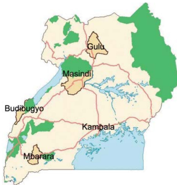
Figure 1. Major towns and districts in Uganda; districts and major towns share the same names. Green shading, national parks; red lines, main roads; blue shading, perennial lakes.

Investigation teams actively searched for case-patients in health facilities and communities and retrospectively reviewed hospital records. Increased awareness of the disease through public education campaigns and the media facilitated reporting of suspected cases to health authorities. Village health teams assisted in case identification and reports and contact follow-up at the community level. Clinical and epidemiologic data were systematically collected from persons with suspected, probable, and confirmed cases. Proxies (usually parents, spouses, or adult siblings) were interviewed for information about case-patients who had died before an interview could be conducted. Persons with suspected cases identified in the community were transported by a mobile ambulatory team to designated isolation facilities. A triage desk was established in the outpatient departments of each health facility in the district to screen for suspected cases and notify the surveillance system. Clinical specimens, including blood, were collected for laboratory testing from all persons with suspected EHF. All contacts were entered into, and follow-up schedules were drawn by using, the Field Information Management System database (10).