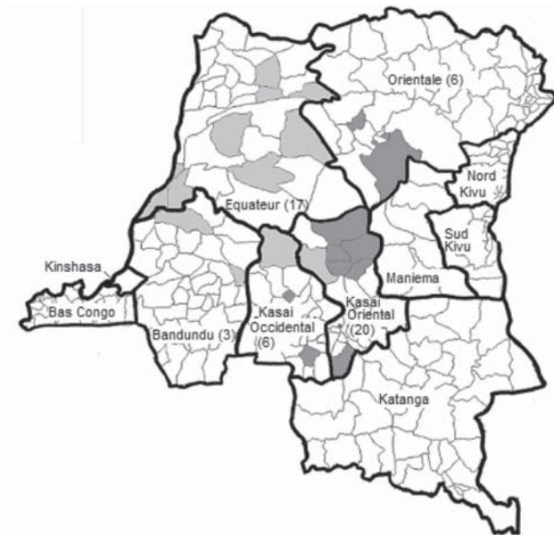
Figure 1. Distribution of 52 confirmed cases of human monkeypox (MPX) by health zone in the Democratic Republic of Congo (DRC), 2001–2004. The cumulative number of cases per province is in parentheses. Confirmed cases of MPX originated from a total of 26 different health zones located in 5 provinces of DRC; most (70.5%) were reported from Kasai Oriental and Equateur Provinces. Two groups can be differentiated on the basis of sequence of the hemagglutinin gene: light gray, group 1; dark gray, group 2. Note: The boundaries of the DRC health zones have since been redrawn. Although the health zones Tshopo and Mweka are not shown (located in provinces Orientale and Kasai Occidental, respectively), the general area is highlighted to represent MPX cases in these regions.

infection in humans because it causes disease clinically indistinguishable from smallpox. Recent outbreaks of MPX in the United States (13), the Republic of Congo (14) and Sudan (15) highlight the capacity of this virus to appear where it has never before been reported. Because clinically, MPX is often confused with chickenpox, laboratory diagnosis is critical to determine whether a suspected case is indeed MPX. In our study, we identified the causative agent for a rash-causing illness in 83% of all patients. We have recently strengthened the MPX surveillance program to improve understanding of the epidemiology of human MPX.